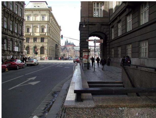
(2) Exit of the metro station unto Kaprova street. The Faculty of Arts building is on the right side.