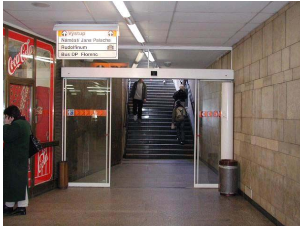
(1) Exit of Staroměstská metro station (signs for “Náměstí Jana Palacha - Rudolfinum”)