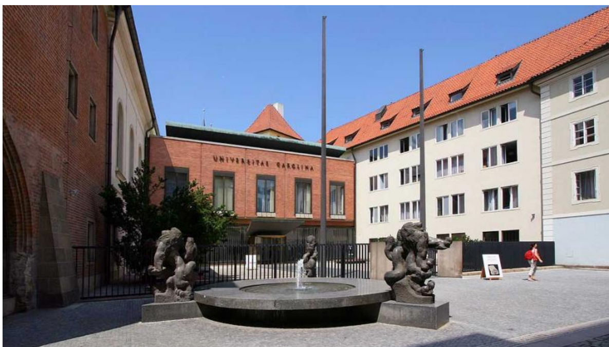
Entrance to the Karolinum from Ovocný Trh