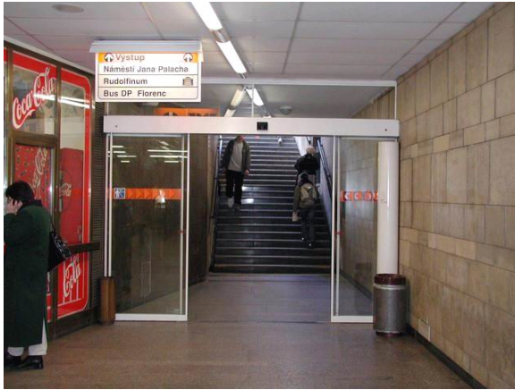
1. Exit of Staroměstská metro station (signs for “Náměstí Jana Palacha - Rudolfinum”)