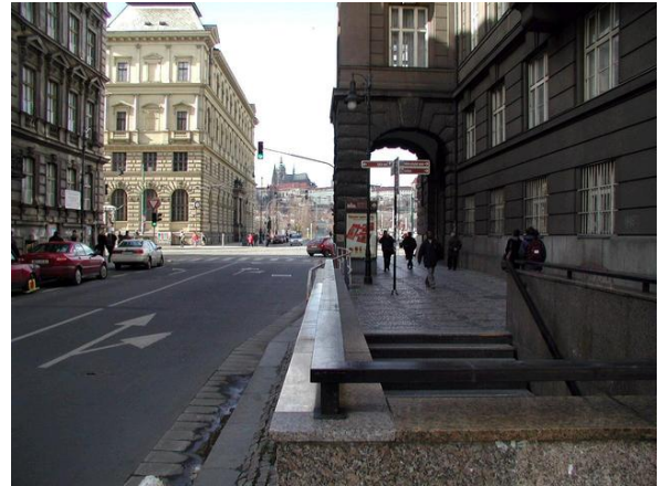
2. Exit of the metro station on Kaprova Street. The Faculty is the grey building on the right side.