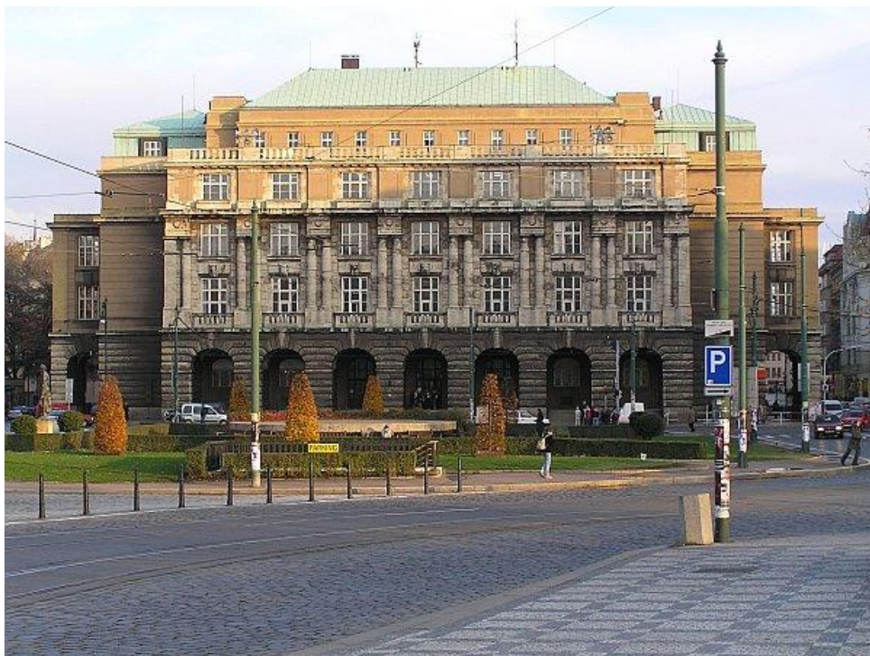
3. Faculty of Arts (main building) Náměstí Jana Palacha 2